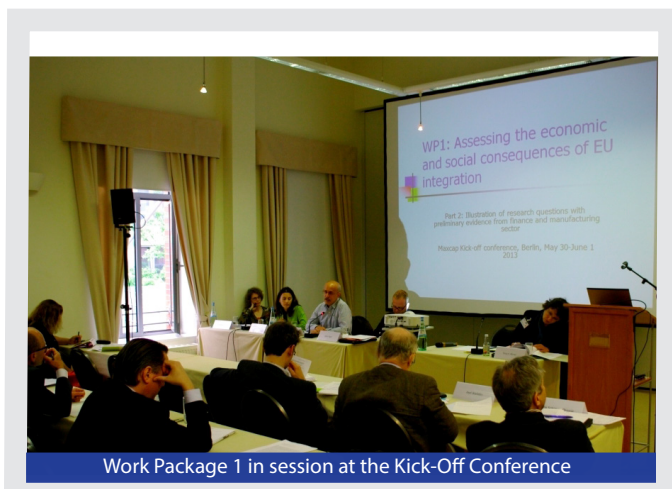
Work Package 1 in session at the Kick-Off Conference

The aim of Work Package 1 (WP1) is to assess the extent to which enlargement has been a success in political, economic, and social terms for the new member states, how the Eastern enlargement's structural effects compare to the domestic changes observable in (potential) candidates, and to what extent the European Neighbourhood Policy (ENP) deploys transformative power in the absence of a membership perspective.